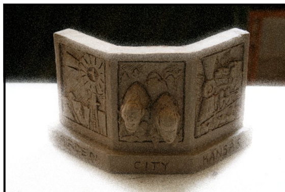
Mockup of bronze statue